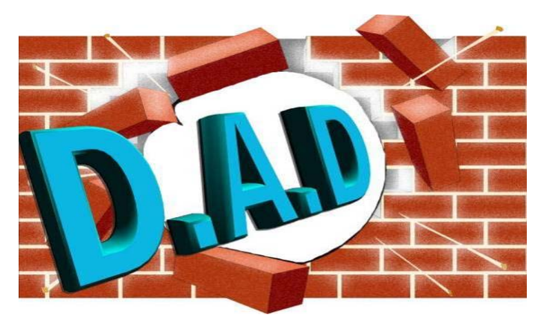
Breaking through Barriers